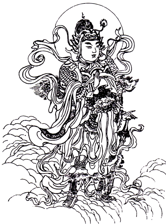
Dharma Protector Wei T'o Bodhisattva