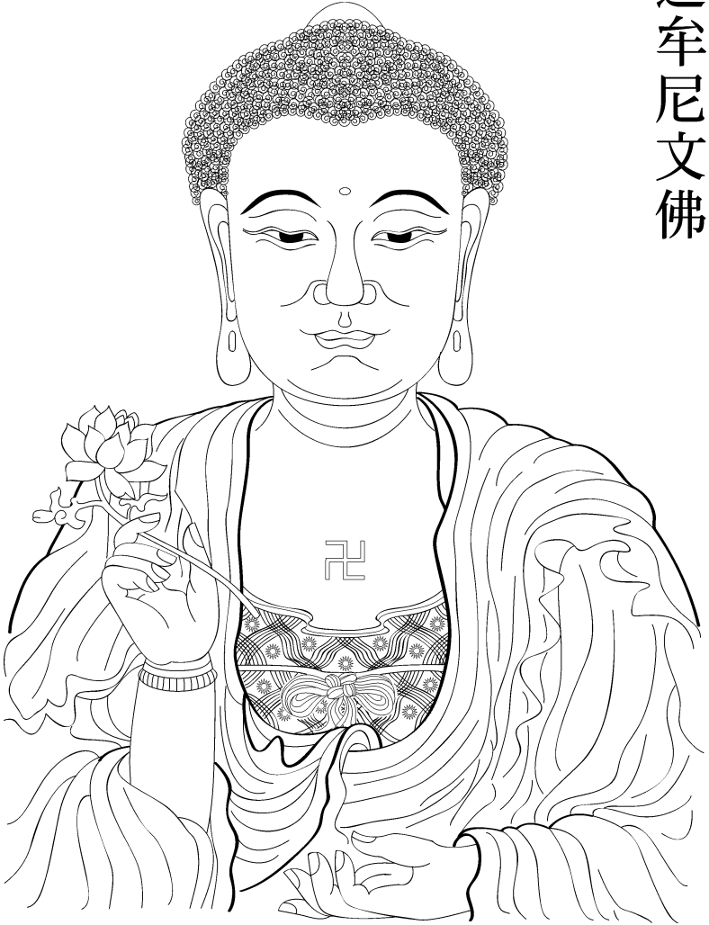
Namo Original Teacher Shakyamuni Buddha